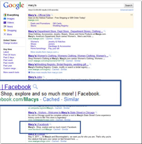
Example of Facebook page in search results on a brand term

Third, it drives engagement on your social media sites. The higher on the list your Facebook page appears, the greater the chance that customers will go to that page and engage in conversations with you, "Like" your page or "Share" an item for sale. And the more customers "Like", "Share", and otherwise engage on your Facebook page, the higher your search rankings are likely to be.