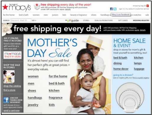
Link to Facebook from Home Page (with brand in alt-text)

Adding links from your website to your Facebook page signal to search engines that your Facebook page is highly relevant for your brand. We recommend you link to your Facebook page from at least your website home page but if possible from as many other pages as possible on your site (e.g., through your footer or standard template). When you do so, make sure the anchor text includes your brand (e.g., "Macys on Facebook") in the text link or define an alt-text image tag with this text in an image link. And also make sure you link to the canonical (short) URL i.e. facebook.com/macys NOT facebook.com/Macys?sk=app_12796642393487