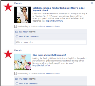
Brand Names Used in Posts

Search engines will analyze the content on your Facebook page to determine for which search terms and phrases this page should be displayed in the search results. In order to increase the relevance of your Facebook page on searches for your brand, you should frequently use your brand name in your posts (usually this happens naturally). It is best if your Facebook page name is an exact match for your brand: if you have not claimed your page vanity name, make sure that when you do, it matches your brand or, if not possible to match your brand exactly, that your vanity name includes the most common search term used on the Internet to look for your brand.