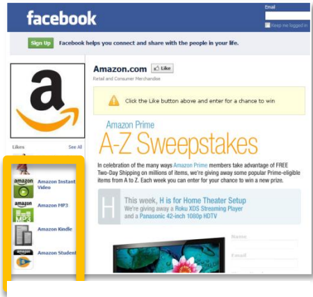
Directory pages on Facebook