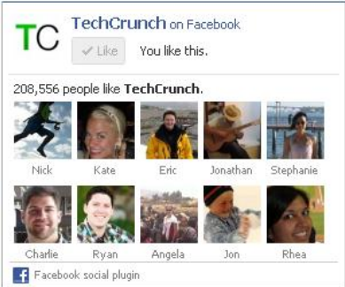
A “Fan Box” on a Website drives social engagement back to your Facebook page

Finally, if you are advertising on Facebook, you should promote “Like” sponsored stories for your Facebook page . This is another simple way to drive social engagement and Likes back to your main Facebook page to help boost its rank.