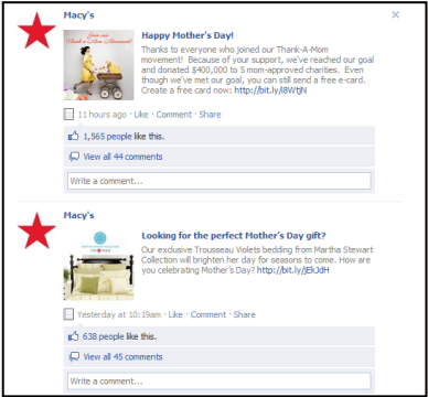
Likes on a Facebook Page

Search engines analyze the link graph – the number and quality of links to a given page – in order to determine the authority of that page. When your Facebook page gets “Likes” from Facebook users , you will accumulate links from public user profiles that are visible to spiders. You should also have a regular stream of posts so that your page constantly appears in newsfeeds for these users. Also, you should design your content to drive social engagement as this will greatly help boost your authority and therefore how well your Facebook page ranks.